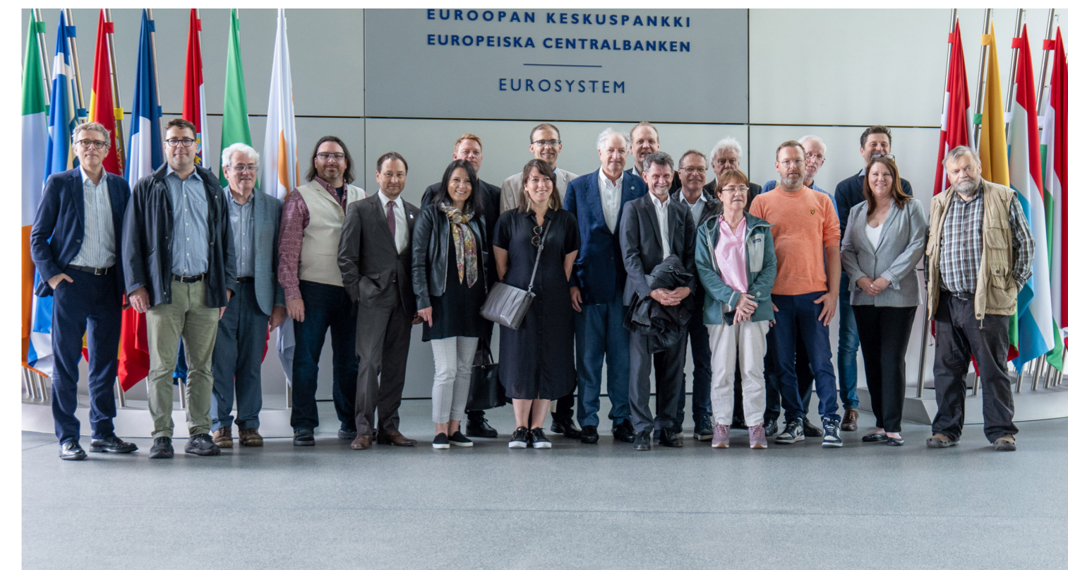
Frankfurt, CEEC Delegates

By focusing on these efforts, CEEC plays a key role in unifying professional practices, creating benchmarks, and supporting members with industry shifts like adopting BIM and achieving sustainability goals.