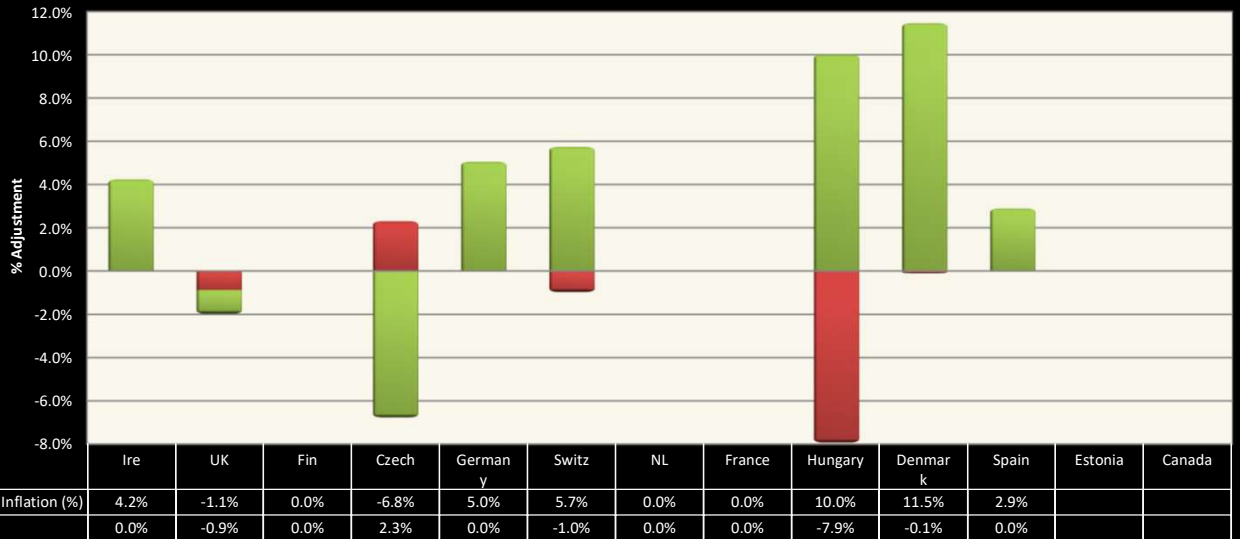
Construction/ Currency Comparison